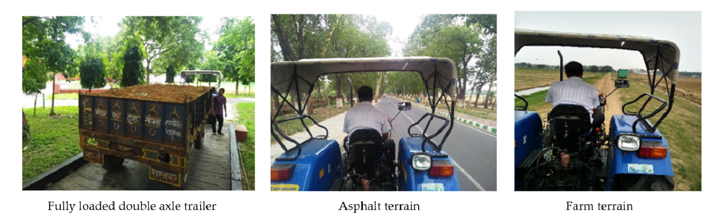
Fig. 2: Fully loaded double axle tractor-trailer and terrain conditions